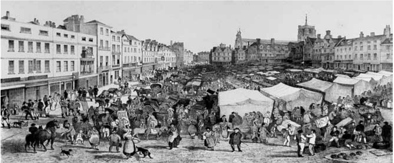
The Market Place, Norwich, Lithograph by H Ninham from a drawing by J S Cotman, 1809