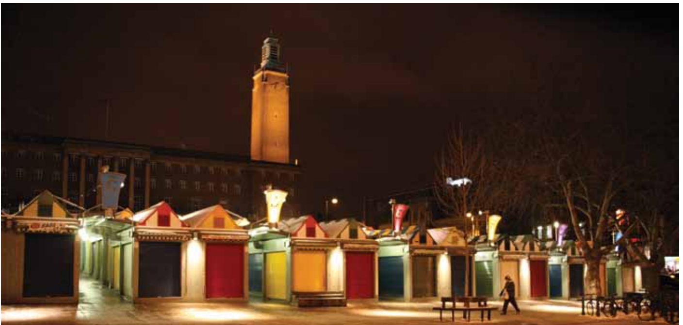
Norwich Market at night, 2010