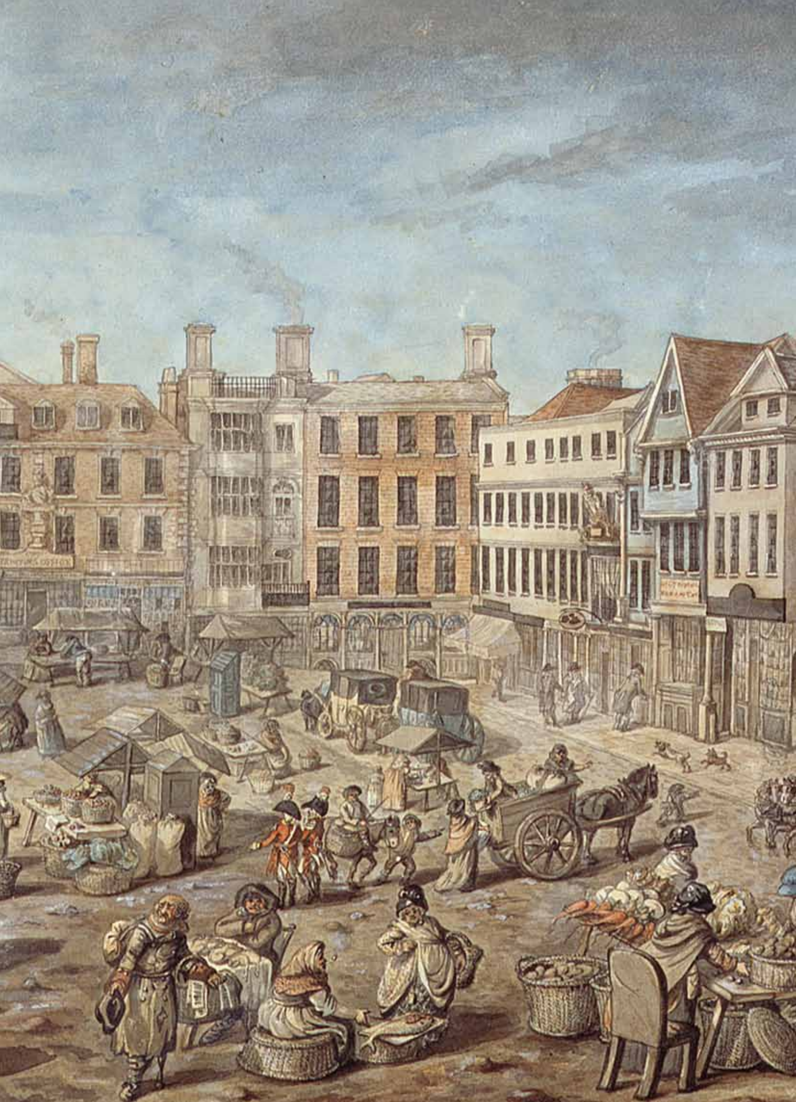
Norwich Market Place, by Robert Dighton, 1799