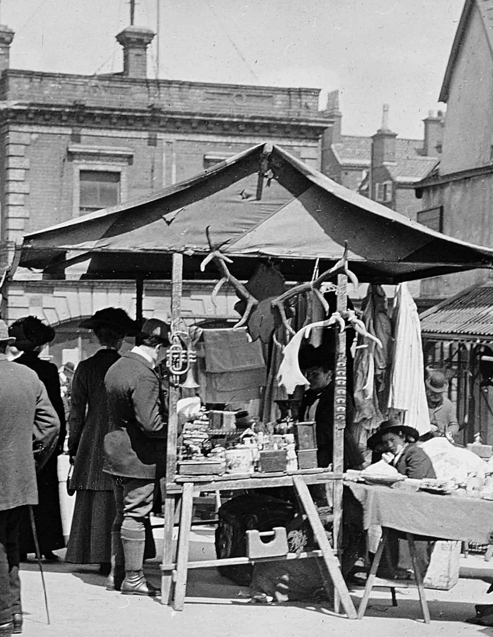
The Lumber Market with Fish Market behind, c1900